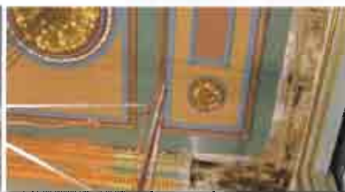
PLASTER & PAINT RESTORATION