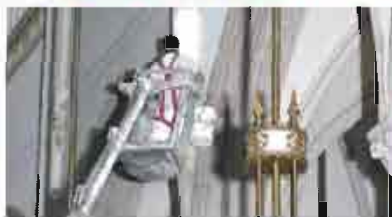
OUR UNIQUE TELESCOPIC EQUIPMENT